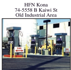
HFN Kona 74-5558 B Kaiwi St Old Industrial Area

No sign-up fees. No membership fees. Unlimited HFN cards per member.