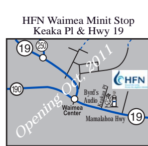
HFN Waimea Minit Stop Keaka Pl & Hwy 19