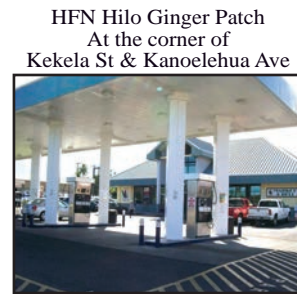
HFN Hilo Ginger Patch At the corner of Kekela St & Kanoelehua Ave