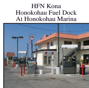
HFN Kona Honokohau Fuel Dock At Honokohau Marina