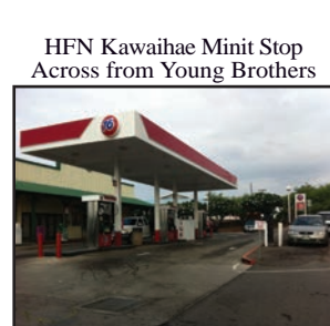
HFN Kawaihae Minit Stop Across from Young Brothers