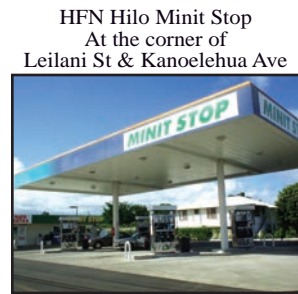
HFN Hilo Minit Stop At the corner of Leilani St & Kanoelehua Ave