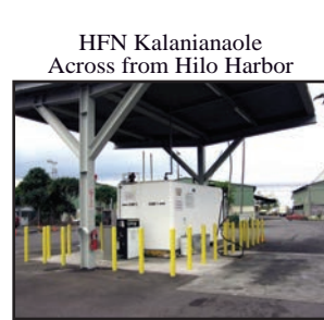
HFN Kalaniana'ole Across from Hilo Harbor