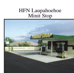
HFN Laupahoehoe Minit Stop