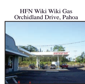
HFN Wiki Wiki Gas Orchidland Drive, Pahoehoe

Sign Up Today! Just Fill Out This Short and Simple Application.